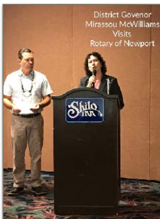
District Governor Mirassou McWilliams Visits Rotary of Newport