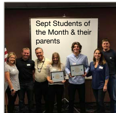
Sept Students of the Month & their parents